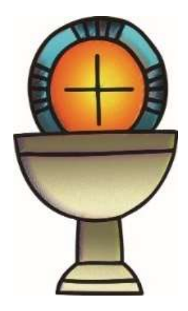
Meal God feeds us with the presence of Jesus Christ

When the greetings of peace have concluded, please be seated.